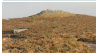
Bronze Age Cairn